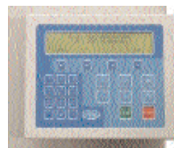
Machine Control Console